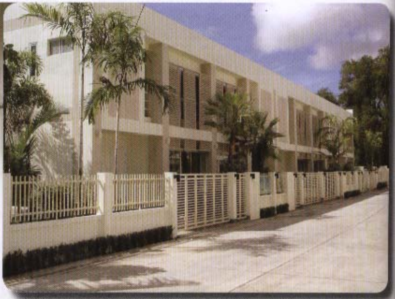
Pictured above Two Bedroom City Villas & Below 3 bed Duplex