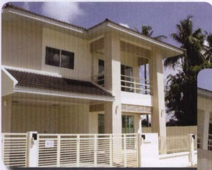
Pictured above 3 bedroom detached house

“The Meadows” – the name itself reminiscent of a haven of domestic tranquility – is the new showpiece, residential estate of the Town & Country Property Group and its “soft launch” on October 19th